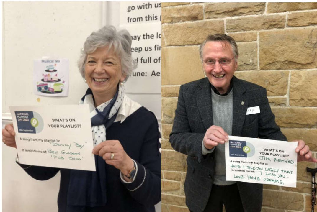
10 th Anniversary of "Playlist for Life"